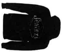
Senior Hoodie The thick, cotton blend sweatshirt is made with pre-shrunk cotton and polyester. Available in sizes S, M, L, XL and XXL.