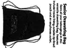
Senior Drawing Bag Store all your belongings in this versatile drawing bag. Features include inside lining, outside zip-lined pouch and an easelphone outcut.

Thank you notes are packed with matching envelopes. Coordinate with the Graduate Open House card for the perfect pair!